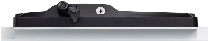
Awning Winder – Colour matched as standard