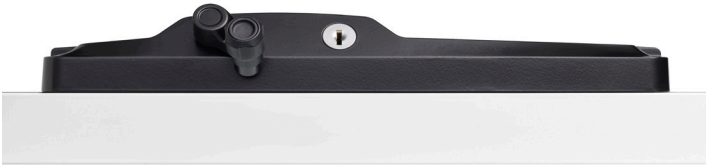
Awning Winder – Colour matched as standard