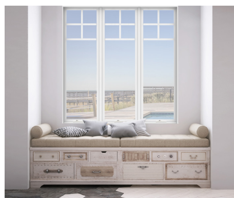
Newport Series - Double