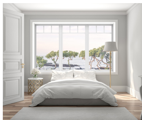
Newport Series - Single

Please discuss your specification with an A&L sales representative to ensure your desired aesthetic can be achieved.